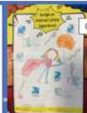
Grace's wonderful entry!