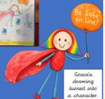
Grace's drawing turned into a character.